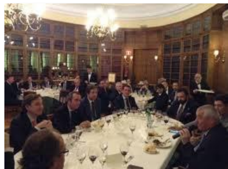
Lunch at the "Library" hall