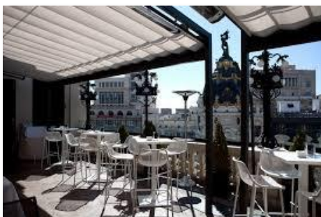
Terrace (Now rented to the Hotel)