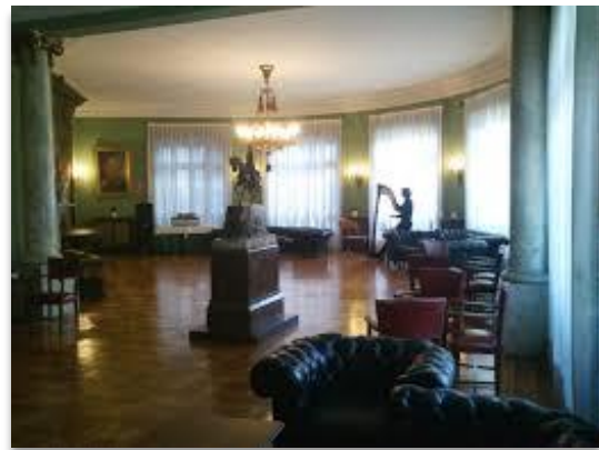
Salón Primo de Rivera